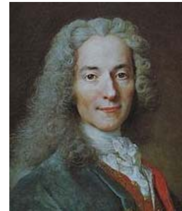
François-Marie Arouet (1694 – 1778) known as “Voltaire”